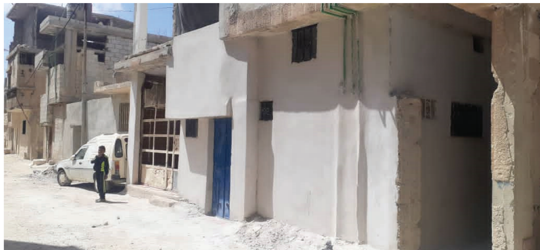
Self-help minor shelter repair conducted by a pilot project with UN Habitat in Dera'a camp .

The average budget allocated per household amounted to US$2,256. Selected families were directly responsible for managing the repairs, from purchase of materials to hiring of daily workers. In order to receive the subsequent installments through bank transfer, families had to demonstrate that they completed at least 75 per cent of the previous stage and respected the allocated budget and rules, as per the contract signed with beneficiaries for this purpose. Throughout the process, UNRWA site engineers closely monitored the activities conducting quality control and providing technical support to families.