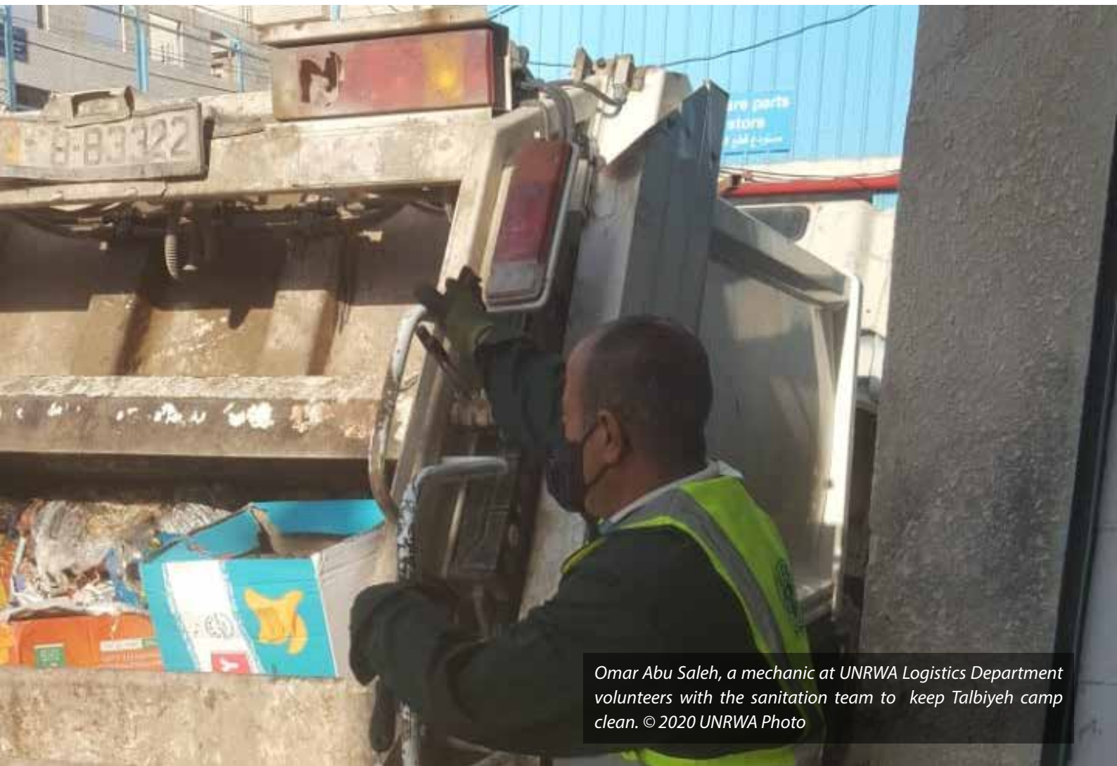
Omar Abu Saleh, a mechanic at UNRWA Logistics Department volunteers with the sanitation team to keep Talbiyeh camp clean.

Under this appeal, protection monitoring, case documentation and referrals, legal counselling and