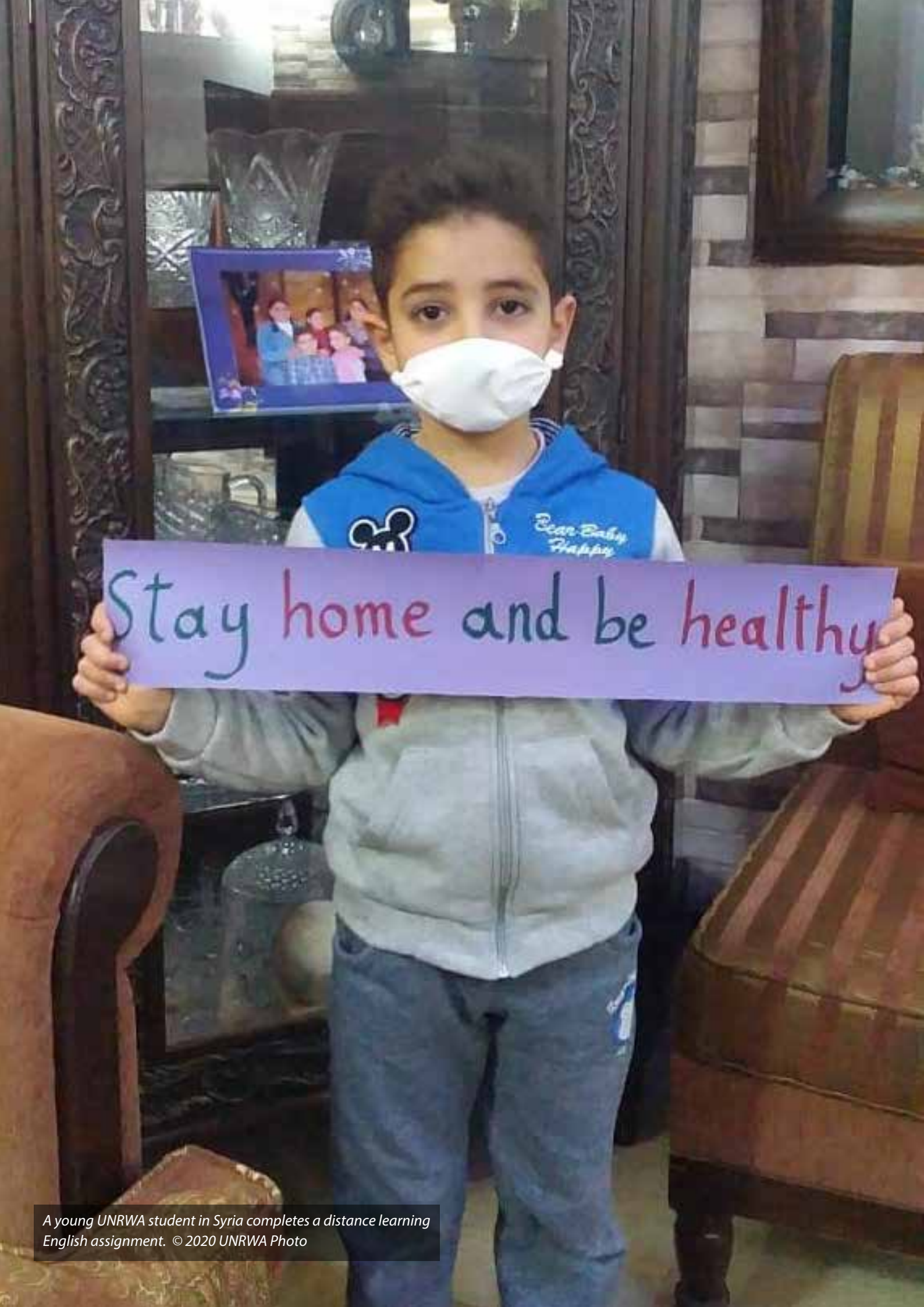
A young UNRWA student in Syria completes a distance learning English assignment.