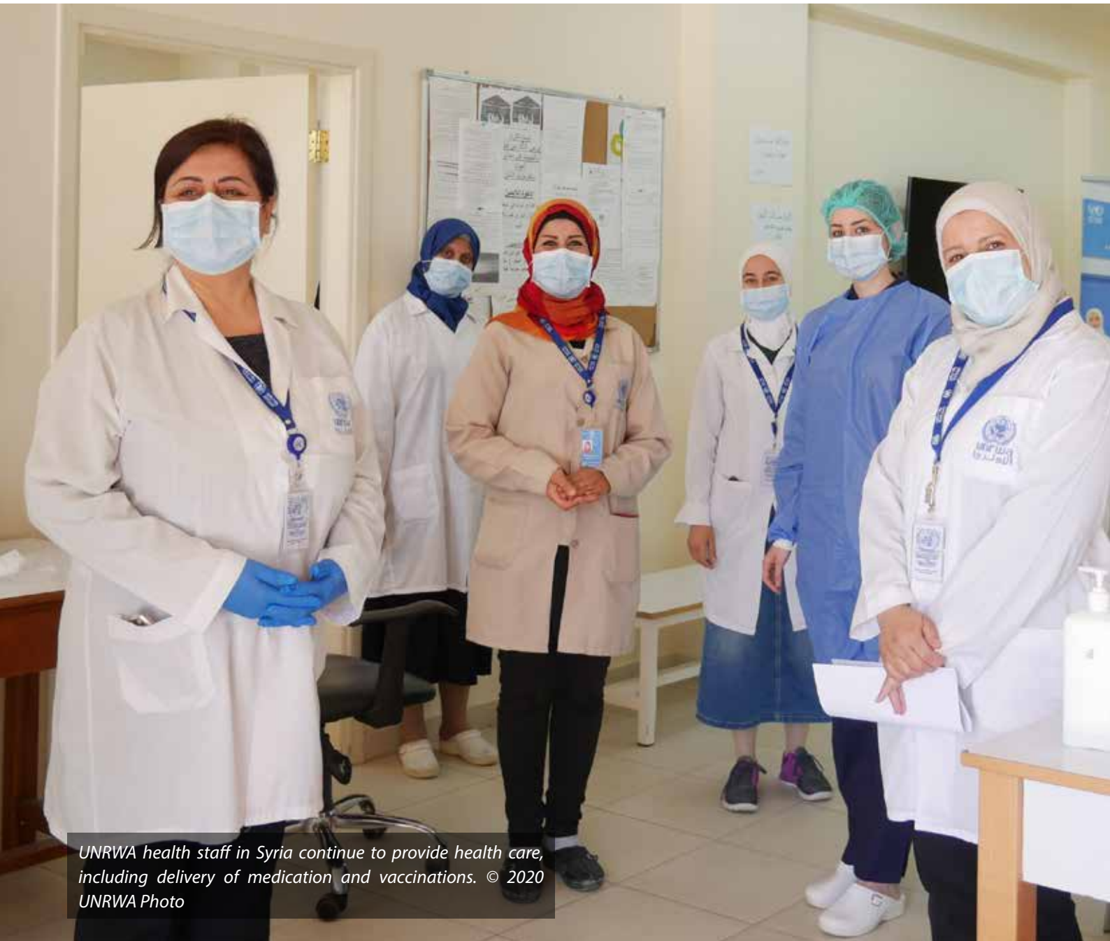
UNRWA health staff in Syria continue to provide health care, including delivery of medication and vaccinations.