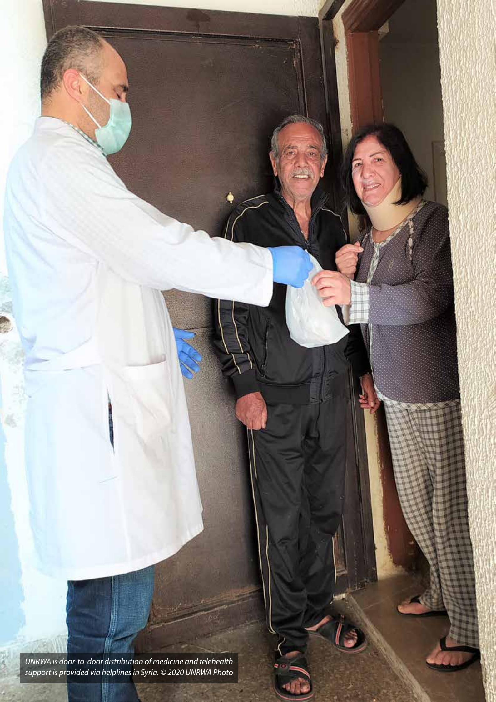
UNRWA is door-to-door distribution of medicine and telehealth support is provided via helplines in Syria.