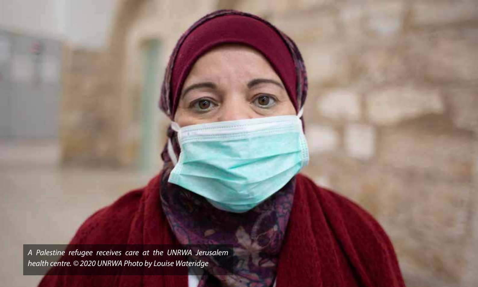
A Palestine refugee receives care at the UNRWA Jerusalem health centre.