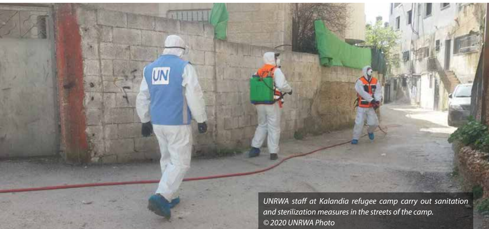
UNRWA staff at Kalandia refugee camp carry out sanitation and sterilization measures in the streets of the camp.

Should conditions allow, UNRWA will discontinue full telecommuting working modalities and will plan for a gradual return to its headquarter offices in a safe manner. To ensure that health standards are met the Agency will procure additional PPE for staff in direct contact with the public at HQ premises (Amman, Jerusalem, Gaza) and Representative Offices (Brussels, Cairo, New York, Washington), and will ensure the continued availability of hygiene and sanitation items in these locations.