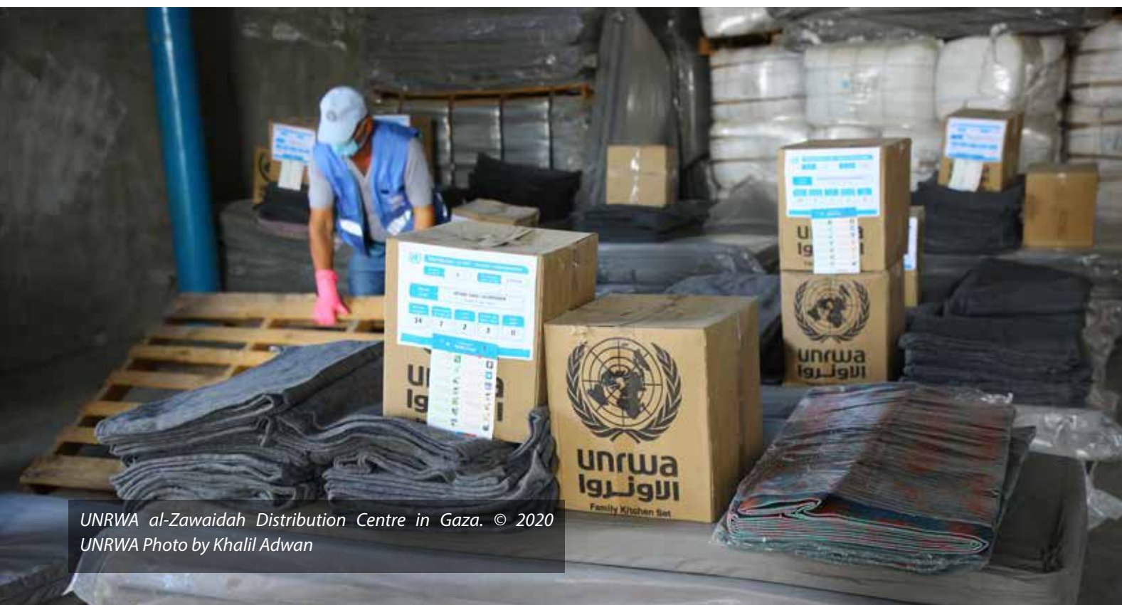
UNRWA al-Zawaidah Distribution Centre in Gaza.

A narrative report on activities funded through this appeal will be produced within six months of the end of the flash appeal period.