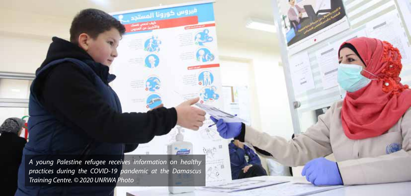
A young Palestine refugee receives information on healthy practices during the COVID-19 pandemic at the Damascus Training Centre.