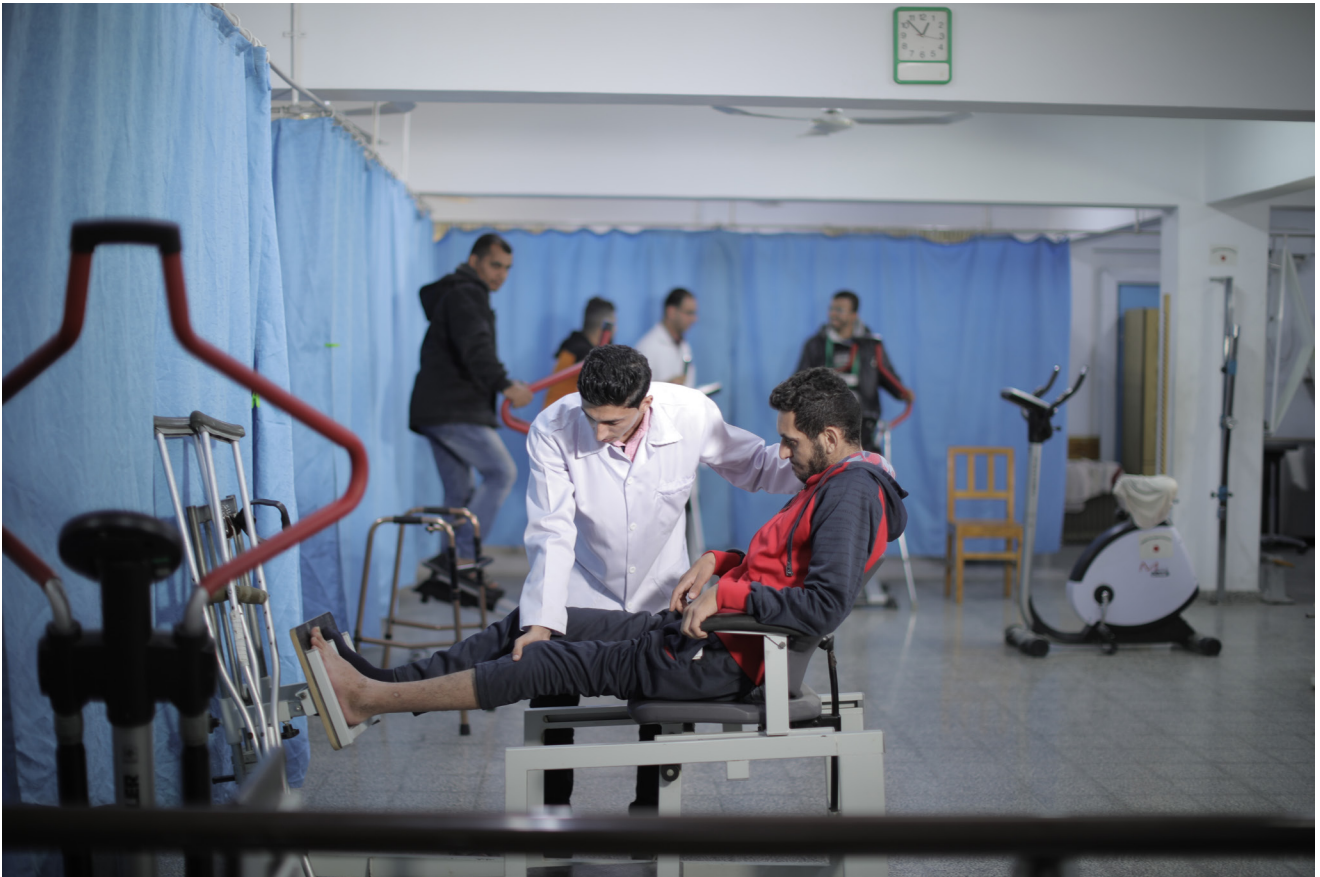
A group of young refugees who injured in the GMR receiving physiotherapy services at the UNRWA clinic in Jabalia camp.